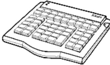
X-keys ® Pro (58 keys)