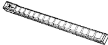
X-keys ® Stick (16 keys)