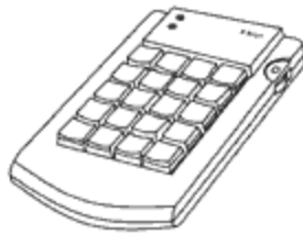
X-keys ® Desktop (20 keys)